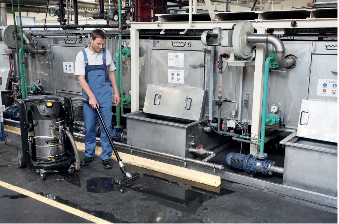
IVC 60/24-2 Tact²