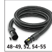
48-49, 52, 54-55