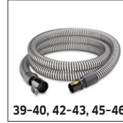
39-40, 42-43, 45-46