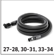
27-28, 30-31, 33-34