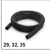
29, 32, 35