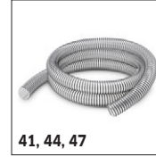
41, 44, 47