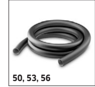
50, 53, 56